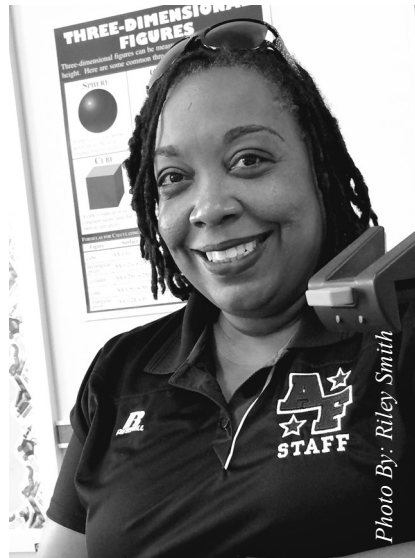
Mrs. Wooten exemplifies women in educational leadership positions.

Segregation within the work force exaggerates the pay gap. In 2015, there has been a total of 149 million full-time and part-time workers, 53% male and 47% female. There proves an unequal representation of women in construction, maintenance, production, and transportation, while men show little interest in the fields of education, health